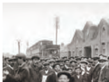
Wolverton Works (c1920)

Wolverton railway station/depot was the reason for the development of Wolverton as a planned town in the 1830s. Halfway between London and Birmingham it was ideal for the servicing and refuelling of locomotives. Supplies to build the new railway town were transported by barge. The Secret Garden was formerly occupied by four 'villas' built by The London & Birmingham Railway Company in the 1840s. Demolished in the late 1960s the area has been developed into a community garden, opened 2005.