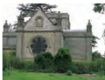
Holy Trinity Church