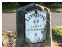
Watling Street milestone

Shenley Brook End , together with its neighbouring parish Shenley Church End and the districts of Shenley Wood and Shenley Lodge, are collectively known as 'The Shenleys'. The Church of St Mary dates back to the 11th century.