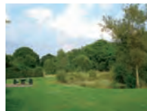
Picnic spot, Howe Park Wood

St Giles' Tattenhoe is a Grade II Listed Church from the 12th century within the Manor House site which itself is a Scheduled Ancient Monument. It is now surrounded by modern housing. Beyond the churchyard in the meadow is the site of the lost village of Tattenhoe.