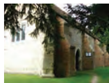
St Giles' Church