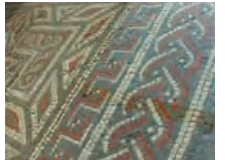
Bancroft Roman Villa mosaic

MK Museum was founded in 1973 by local volunteers collecting items from farms and factories that were closing with the development of Milton Keynes. Exhibits depict life from 1800 to the present day.