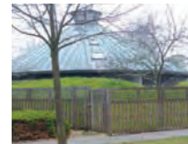
Eco Home Round House

All Saints Church is the oldest surviving building in Loughton. The village was recorded in the Domesday Book of 1086 as Lochintone . Manor Farm is one of the oldest non-church buildings in MK. Dating from the early 1500s with later additions, the house was originally surrounded by a moat and is said to be haunted.