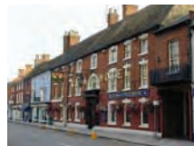
The Cock Hotel