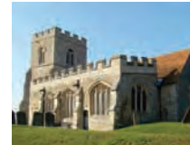
All Saints Church

The Green , once the centre of Little Loughton, a separate parish, retains a rural atmosphere, helped by the development of the Loughton Valley Park. Here also are the medieval fishponds.