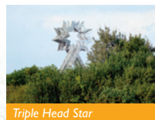
Triple Head Star