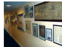
National Badminton Centre

Lodge Lake is a popular park with visitors, who appreciate both the fishing and the chance to see wildlife such as herons, swans, little grebes or even kingfisher.