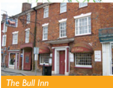
The Bull Inn

19. Picking up NCR51 crossing under V2 Tattenhoe Street continue following NCR51 alongside brook through Emerson Valley under V3 Fulmer Street into Furzton following the route along Loughton Brook.