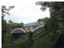
Iron Trunk Aqueduct

The Grand Union Canal , was built to link London with the industrial Midlands. One of the last sections to be completed was the crossing of the River Ouse at Wolverton with the Iron Trunk Aqueduct. The Viaduct was a Robert Stephenson structure for The London & Birmingham Railway Company, the first Company to link London to another major city. Built in 1838 of red brick with stone capping, it carries the railway line 50 feet above the River Ouse.